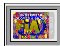
Figure 2 – FIA hologram

Please note also that products manufactured before 1 January 2016 use the former labelling system without the FIA hologram and they are still valid . The former FIA label must comply with the template in Figure 3 and it does not include the manufacturing year.