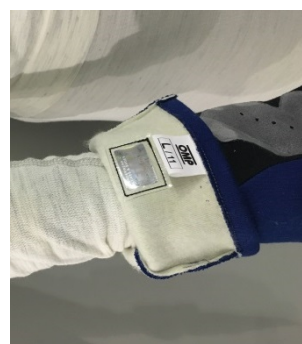
Figure 8 – Example positioning of the homologation label and FIA hologram on gloves.

We will inform you in due time if we decide to fix a deadline for the validity of the old labelling system.