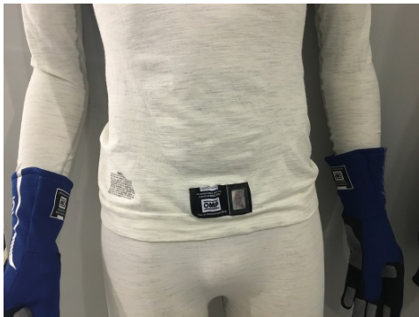
Figure 4 – Example positioning of the homologation label and FIA hologram on underwear top.

Underwear, top and bottom: the homologation label and FIA hologram must be affixed on the exterior of the garment at waist level at the front or rear as shown in the examples in Figures 4 and 5.