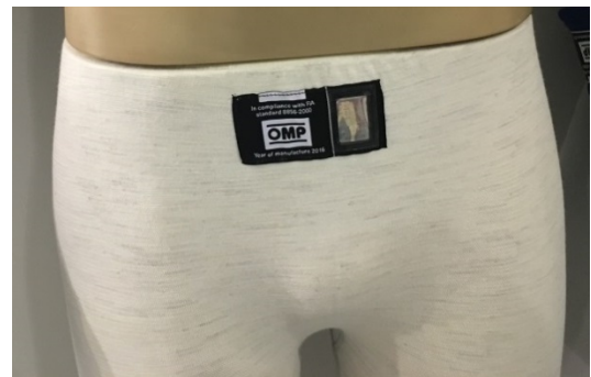
Figure 5 – Example positioning of the homologation label and FIA hologram on underwear bottoms.

Balaclavas: the homologation label and FIA hologram must be situated on the exterior of the balaclava, in the lower-front section as shown in the example in Figure 6.