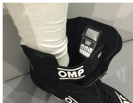
Figure 7 – Example positioning of the homologation label and FIA hologram on shoes.

Gloves: the homologation label must be affixed to the exterior cuff of each glove, and the FIA hologram must be affixed to the inside of the cuff, positioned exactly beneath the homologation label, as shown in Figure 8.