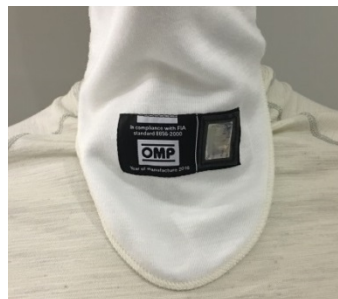
Figure 6 – Example positioning of the homologation label and FIA hologram on a balaclava.

Balaclavas: the homologation label and FIA hologram must be situated on the exterior of the balaclava, in the lower-front section as shown in the example in Figure 6.