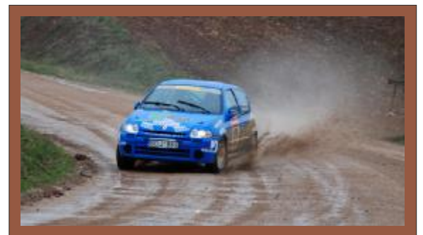
After a pause in the rally “Žemaitija” tracks return local crew Vilmantas Pupius and Gediminas Račas